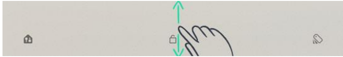
Figure 3 Removing Ads from Screen